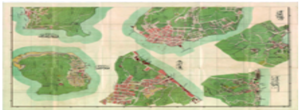
Fig. 1: Istanbul in Ottoman Maps.

Istanbul, also formerly known as Byzantium and Constantinople, presents a fascinating connectivity point between Europe and Asia. Istanbul, as the capital of the Byzantine Empire, then the Ottoman Empire, has an amazing architectural legacy representing multiple religious, cultural, and political perspectives 1 . The primary aim of this paper is to simply investigate the influence of Ottoman, and Islamic architecture, on modern-day urban development practices in Istanbul under the accelerated context of urban transformation and globalization during the past decades since the late 20th century.