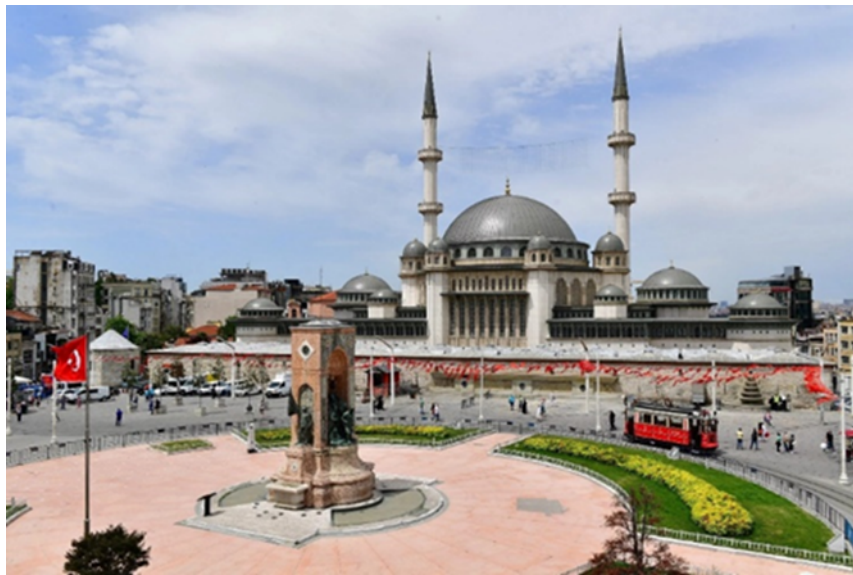
Fig. 3: Taksim Mosque.

Taksim Mosque (2021) is a prominent and polarising case of the reassertion of Islamic signification in a secular urban context. Built in Taksim Square, a public space long associated with the secular modernist identity of the Republic, the mosque's western model includes key references to classical Ottoman architecture that includes a central dome, pencil minarets, ornate detailing, and so on 9 . While it can be argued that the mosque's aesthetic sensibility is contemporarily aligned with Ottoman models, many have critiqued its location and scale are politically symbolic rather than aesthetic considerations, especially given the mosque's proximity, and formal visual reference, to the Atatürk Cultural Centre 10 . Its construction was a spatial remapping of the square toward a more overtly Islamic-nationalist context and legitimizes the state's broader political objective to re-centre Islamic identity in urban Turkey's consciousness.