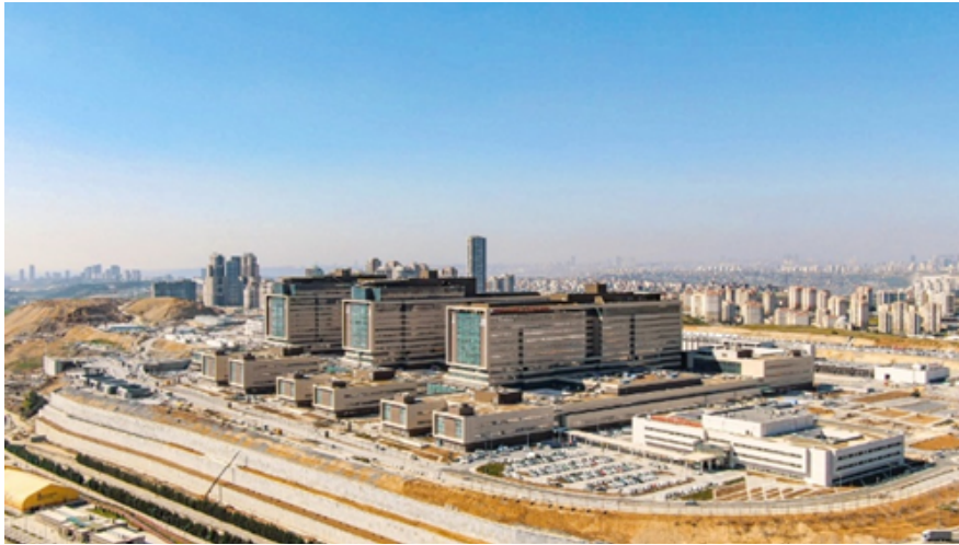
Fig. 4: Başakşehir Çam and Sakura City Hospital.

cultural legitimacy and spatial identity. Through design, a meaningful connection of public health infrastructure with cultural heritage is established, even while it operates under a secular and technocratic framework.